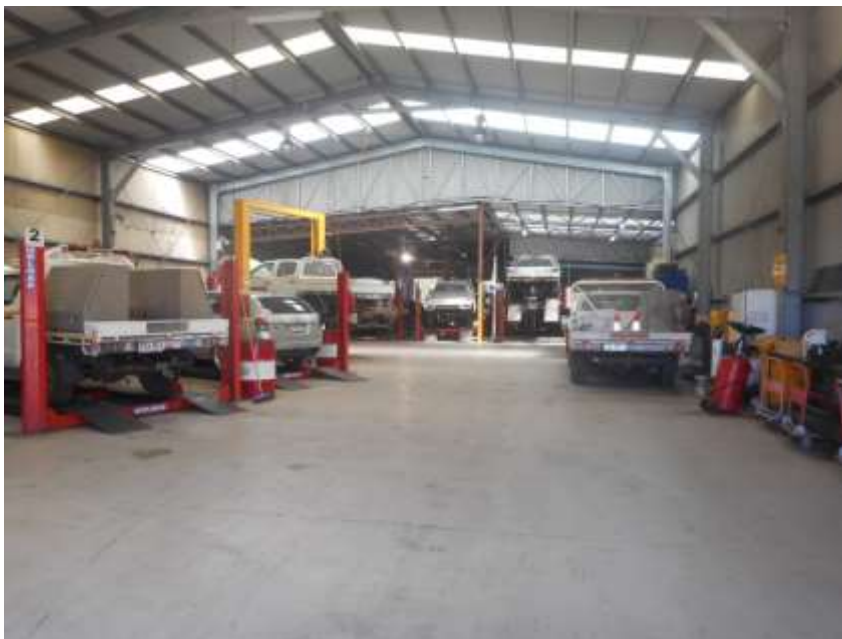
Inside workshop at 23 Bacon Street