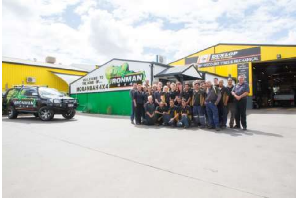
23-25 Bacon Street – Mechanical and Auto Electrical Division/ Repco Service Outlet and Ironman 4x4 Distributor

Moranbah Discount Tyres and Mechanical Pty Ltd is a family owned business established in 2005