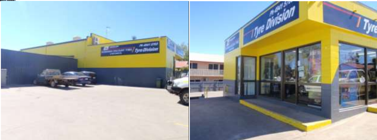
Tyre Division at 31 Mills Ave Moranbah