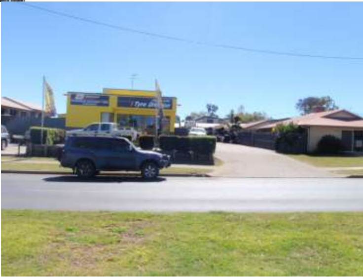
Tyre Division Workshop at 31 Mills Ave