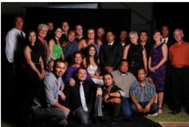
MTA Excellence in Business Awards 2015

We hope that we can be of assistance to you in the near future and look forward to providing you with excellent customer service. No job is too small or too big for our qualified staff.