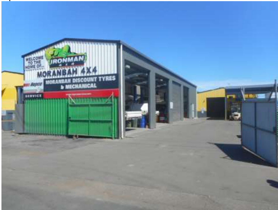
Rear of workshop at 25 Bacon Street

Repco Authorised Service provide a nationwide warranty and Auto-Tech trained mechanics, fully backed by Repco.