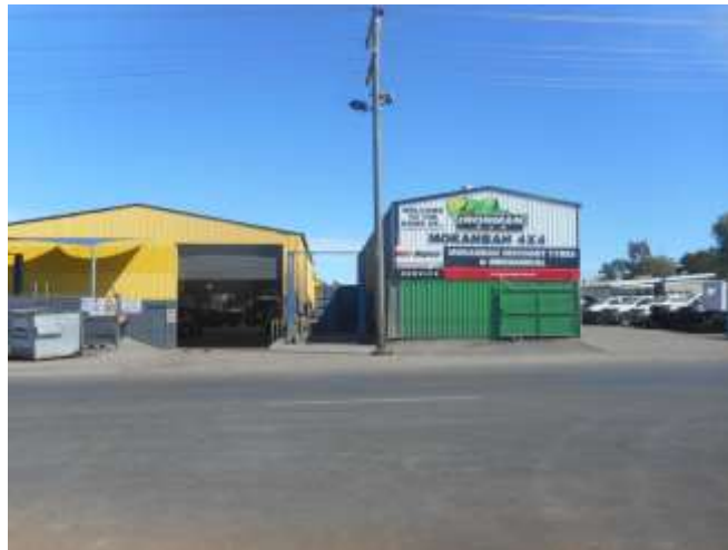
Rear of Workshops at 23 and 25 Bacon Street Moranbah