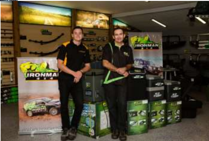
Ironman Showroom 23 Bacon Street Moranbah