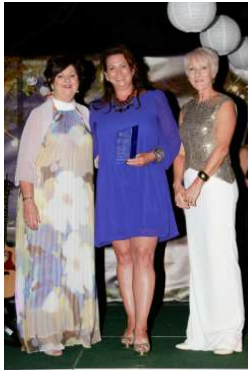
Excellence in Business Retail Moranbah Discount Tyres & Mechanical 2015

NOMINATED FOR TELSTRA AUSTRALIAN BUSINESS AWARDS 2013 AND 2014