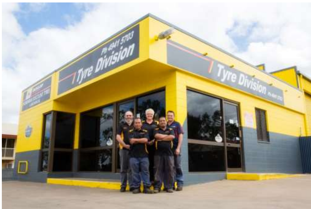
29- 30 Mills Ave – Tyre Division/Underground Earthmoving Tyre Division