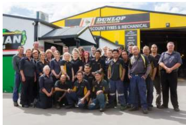
Our Team – 35 employees – 22 hoist – 20 tradesmen and 11 office staff