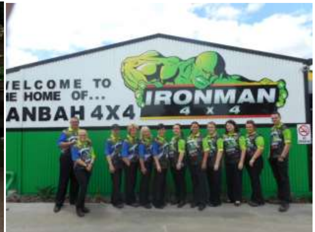
Ironman workshop 23 Bacon Street Moranbah

Today the vast continent of Australia serves as the perfect testing ground for Ironman 4x4 products, so whether crossing the outback in search of adventure or just driving the children to school in your local suburb, Ironman 4x4 can offer quality and value for money.