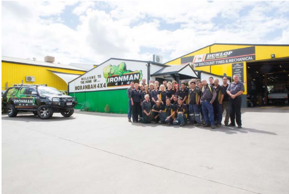
23-25 Bacon Street – Mechanical and Auto Electrical Division and Ironman 4x4 Distributor