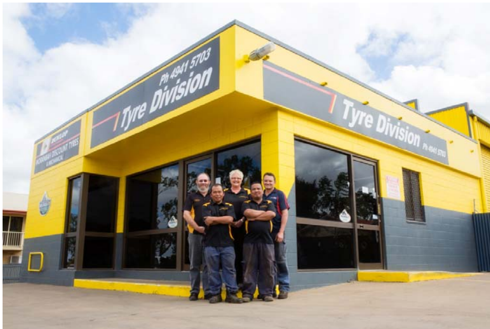
29- 30 Mills Ave – Tyre Division/Underground Earthmoving Tyre Division